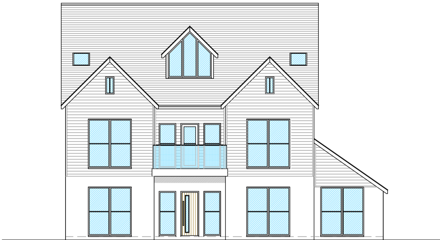
Proposed Front Elevation, Scale 1:100