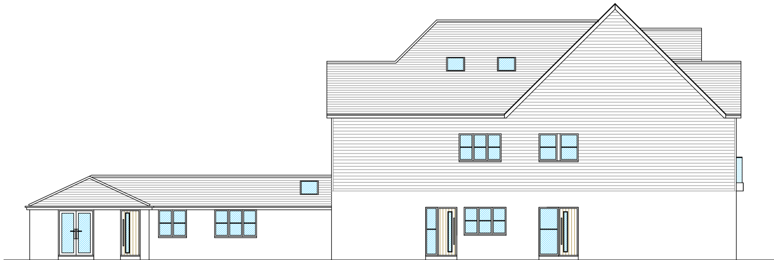
Proposed Side Elevation, Scale 1:100