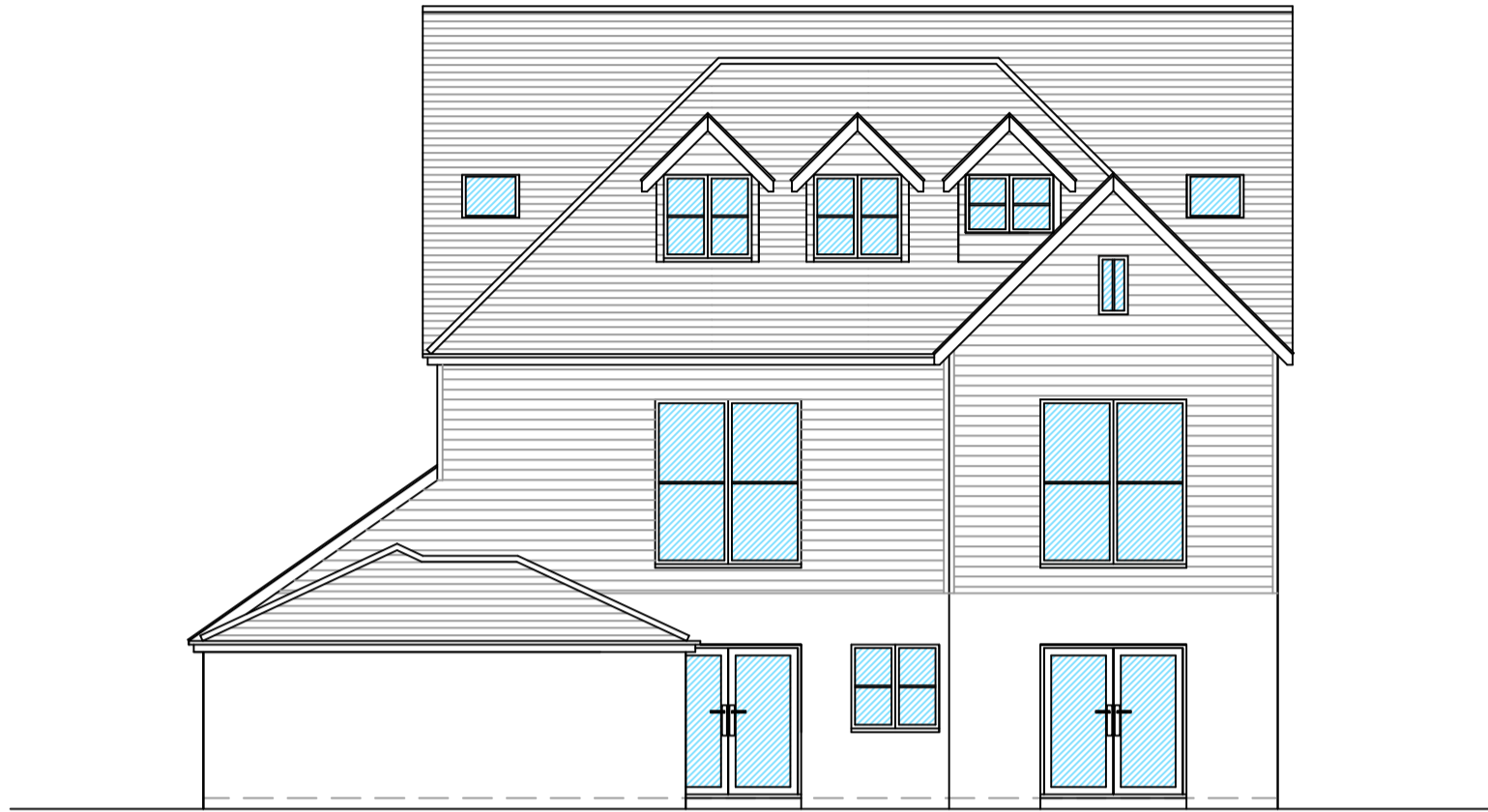
Proposed Rear Elevation, Scale 1:100